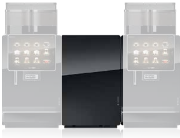
SU12 Twin refrigeration unit (12 l) The impressive solution