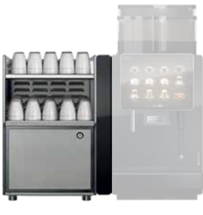
Chill & Cup The space-saving solution