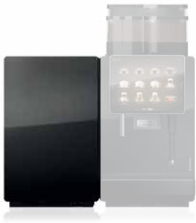
SU12 refrigeration unit (12 l) The impressive solution