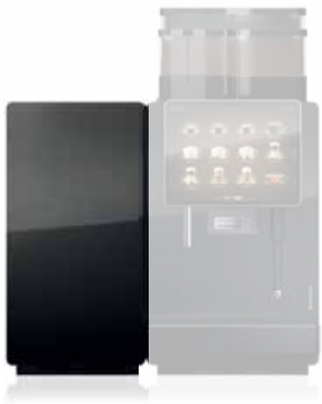
SU05 refrigeration unit (5 l) The elegant solution