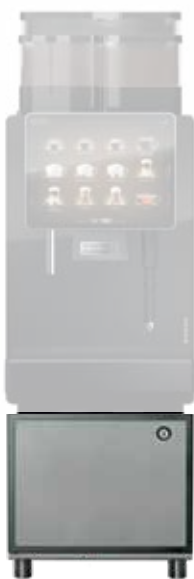
Base refrigeration unit (UC05) The space-saving genius