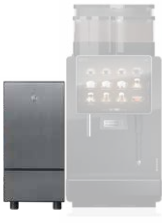
KE200 The compact solution