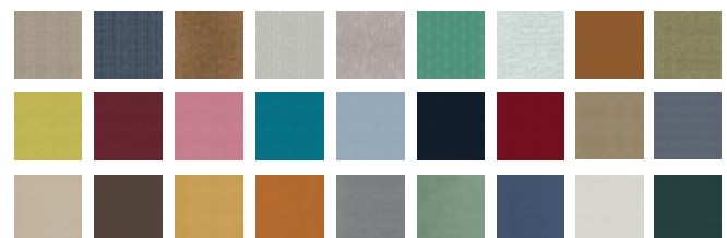
500 EXCLUSIVE GRADED-IN FABRICS