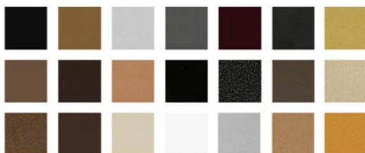
OVER 50 METAL FINISHES